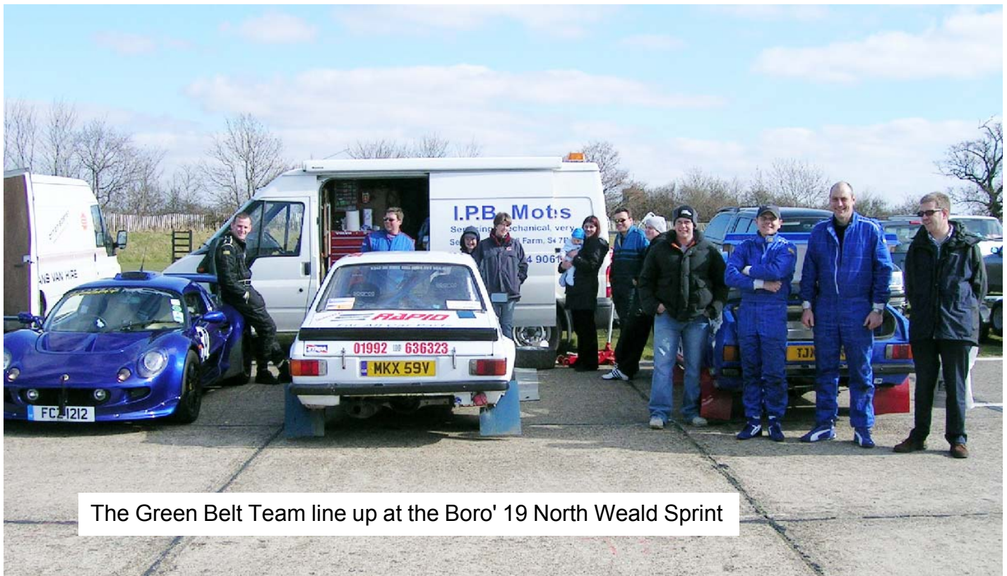
The Green Belt Team line up at the Boro' 19 North Weald Sprint