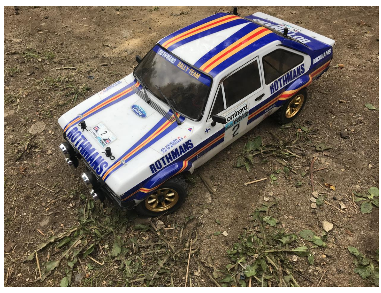
WAYFARER APRIL/MAY 2020