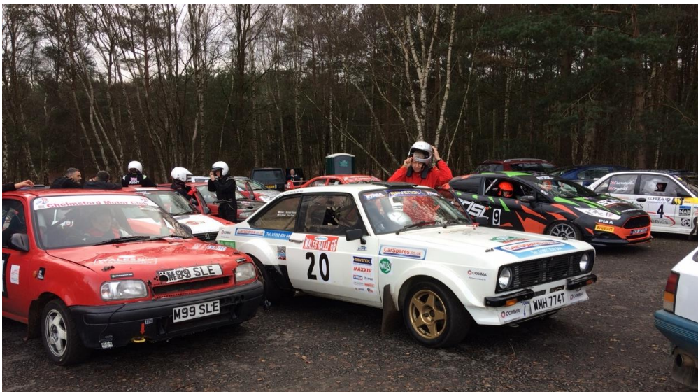
Waiting at the end of stage one ready to start stage two

The event consisted of 8 stages of 3 plus miles each, after a steady run we finished stage one in 17 th place, with many sections under green moss and mud it was very slippery in places with the additional hazards of 100mm kerbs on most of the route. At the end of stage one you ended up in a car park at the end of the firing range where you stayed until the last car finished. Then you did Stage two which was stage one in reverse, got it so far, well it worked quite well, then back in the service area ready for the next stage. The Car Spares Escort was fairly consistent all day being 15-16 th quickest on all of the 8 stages.