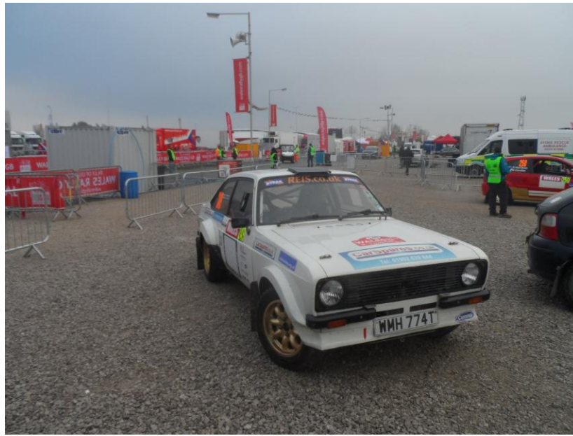
The start of Day Two leaving the Service Area at Deeside

After the stage finish we turned into the fuel halt at the end of the stage as we low on fuel. After a great day in the Welsh forests we headed back to the service area. On arrival at Deeside at 7.30pm turned the car engine off, went to restart the car and it was dead. Got pushed into the service area, how embarrassing. Karl got the car jacked up and started checking the rear suspension, as it happened Will Barnard turned up (that's Ian Barnards son of IPB Motors) I said "Have you got your overalls" Of course was replied within minutes will was under the car extracting the sump guard and removing the offending Starter motor. (Ian - you have Will well trained). New tyres on the car and we were ready for the Sunday entertainment.