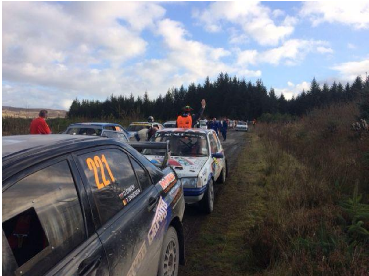
Re Group control at the Brenig Stage