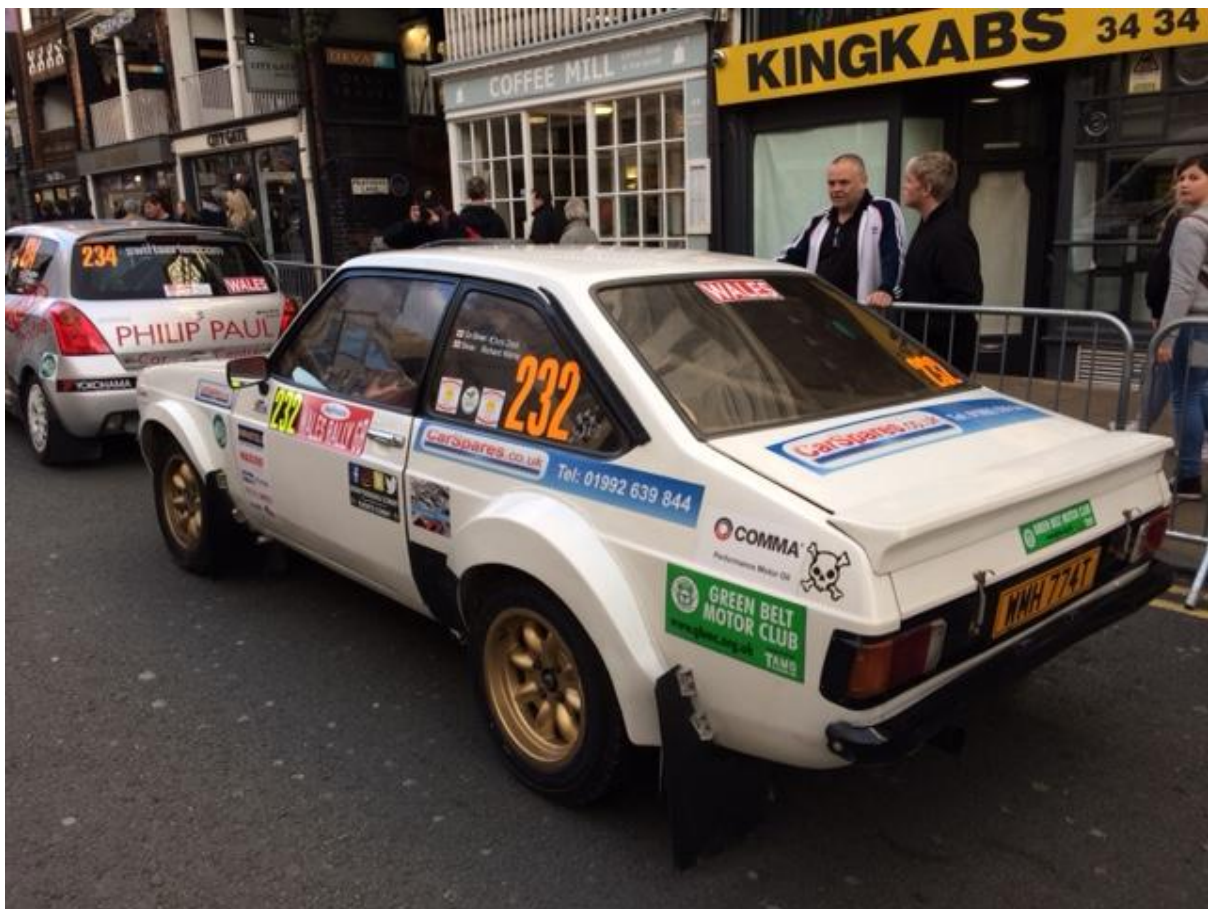
Awaiting for the finish ramp