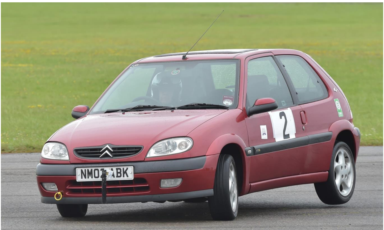
Rob Choules lifting the rear inside wheel at the Sprint