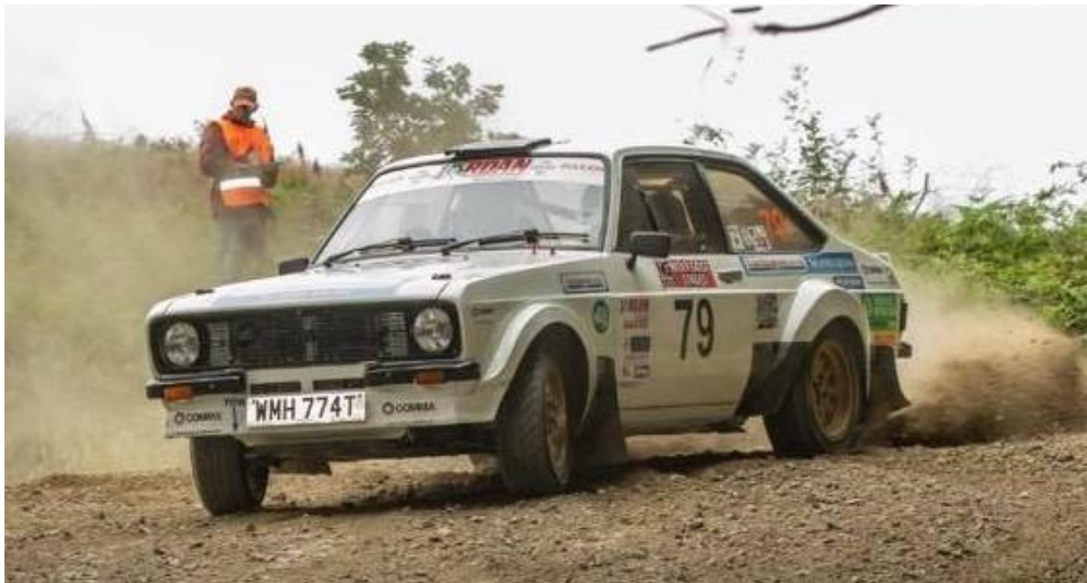
On Crychan stage