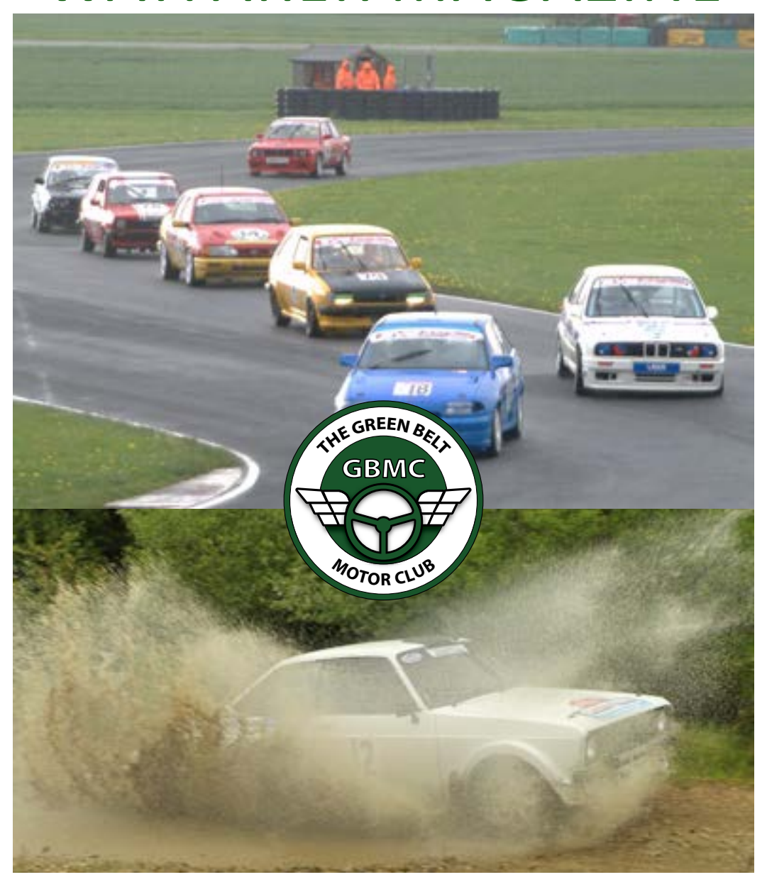
50 Glorious years in the making

The Monthly Magazine of the Green Belt Motor Club