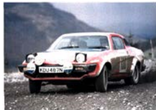
Anglesey Scaffolding Gwynedd Rally