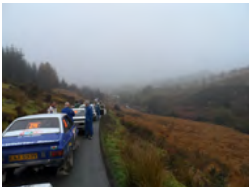
Image: Waiting for the stage to start