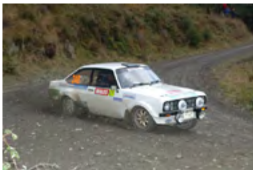
Image: Action in Dyfnant Foest